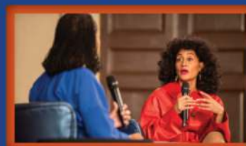
Tracee Ellis Ross February 20, 2023

REPLAY CONVERSATIONS - STREAM ONLINE Spelman.edu/CourageousConversations