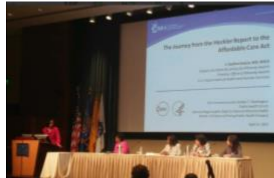
Left: 100 th Anniversary of Negro Health Week Celebration in Atlanta, GA