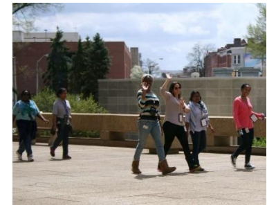
Maryland DHMH employees participating in the 1 Mile Walk for Wellness.