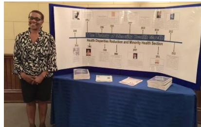
Michigan DHHS's exhibit traced the history (1898 to present) that led to the recognition of National Minority Health Month.