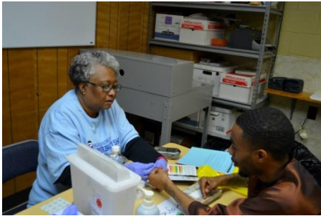
A participant getting a health screening at an Arkansas Minority Barber & Beauty Shop Health Initiative event