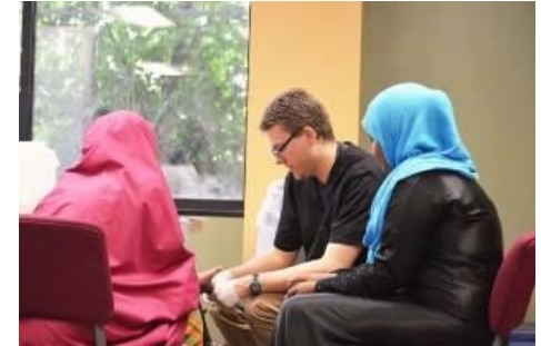
Minority Health Month at the Somali Community Self Management Agency in Salt Lake City, Utah