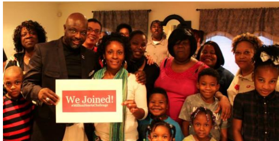
Virginia's 100 Congregations for Million Hearts Event in Richmond, VA