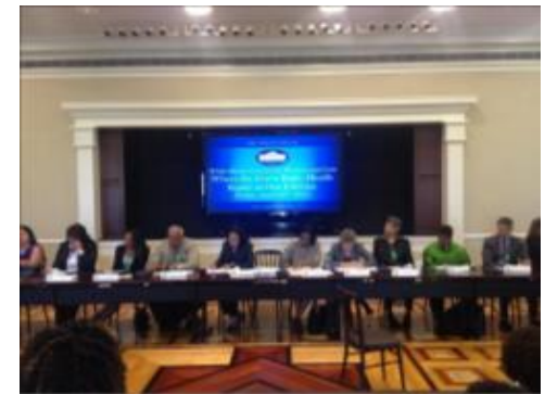
Right: White House NMHM Roundtable