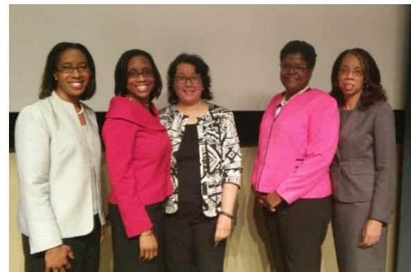
Above: OMH Directors and staff at the 100 th Anniversary of Negro Health Week Celebration in Atlanta, GA